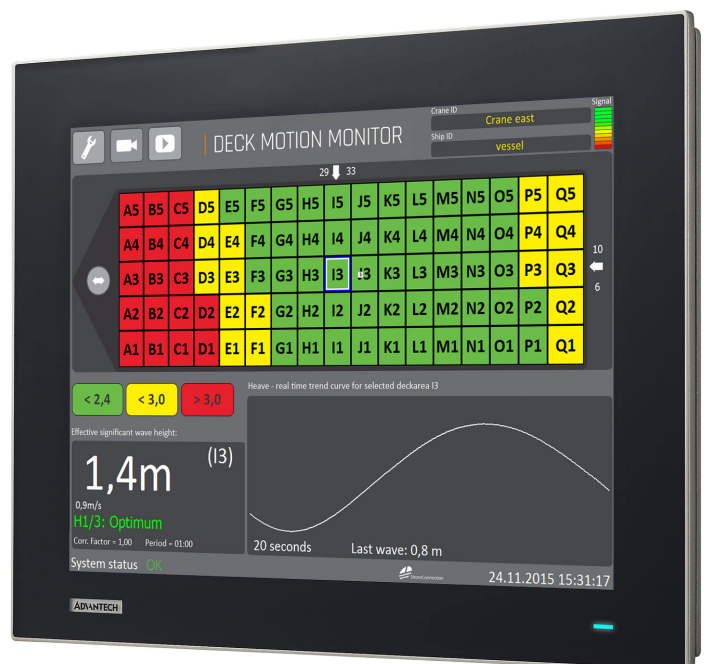
A typical DMM display ▶